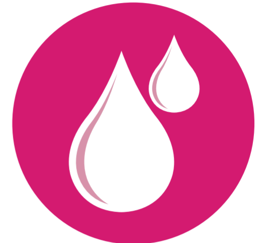
Leaking fluid from the vagina