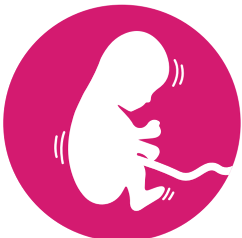
Baby's movements slows down or changes