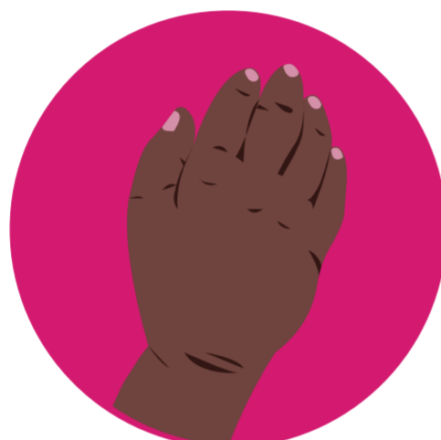
Swelling in face, hands or legs