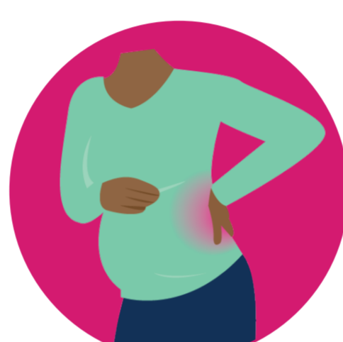
Cramps in your lower back or pelvic area