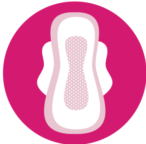
Spotting or bleeding