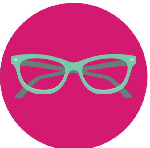
Blurred vision, seeing spots