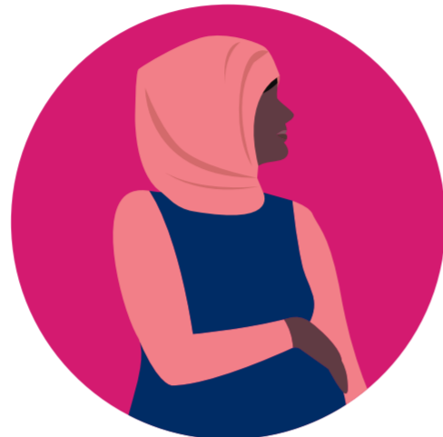
Sharp or continuing abdominal pain