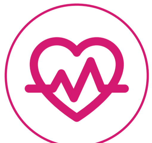
You feel that something is wrong

To read more about any of these symptoms scan this QR code with your phone camera: