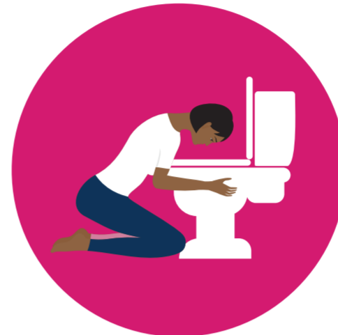
Vomiting all or most food