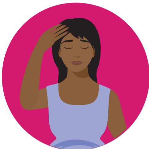
Persistent severe headache