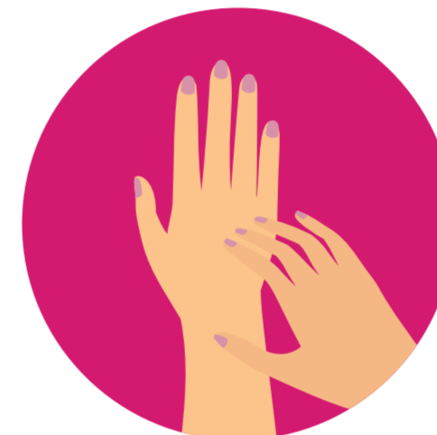
Itching, especially on hands and feet